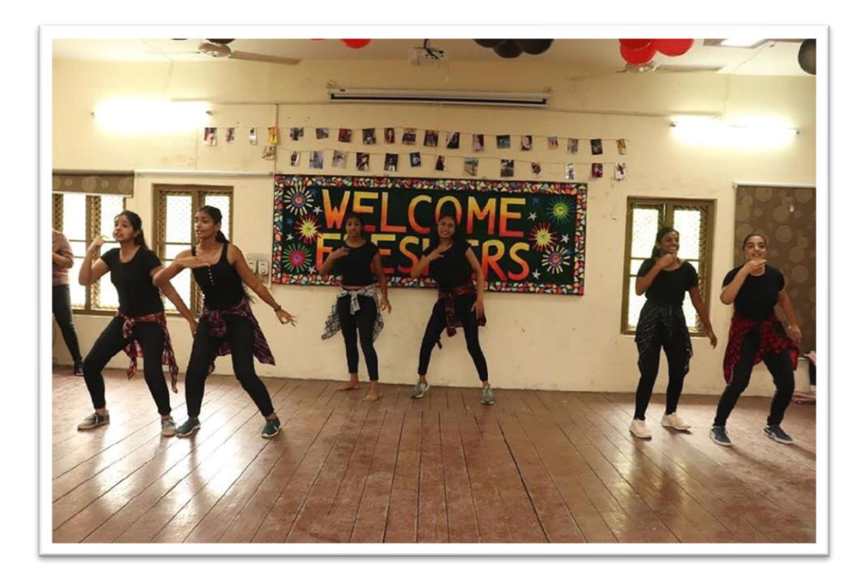
Freshers' Welcome by Economics Association 2019-20